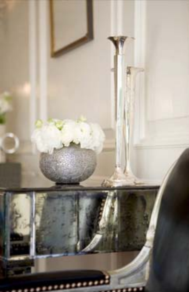
Mercurial elements create intrigue while throwing light in the foyer