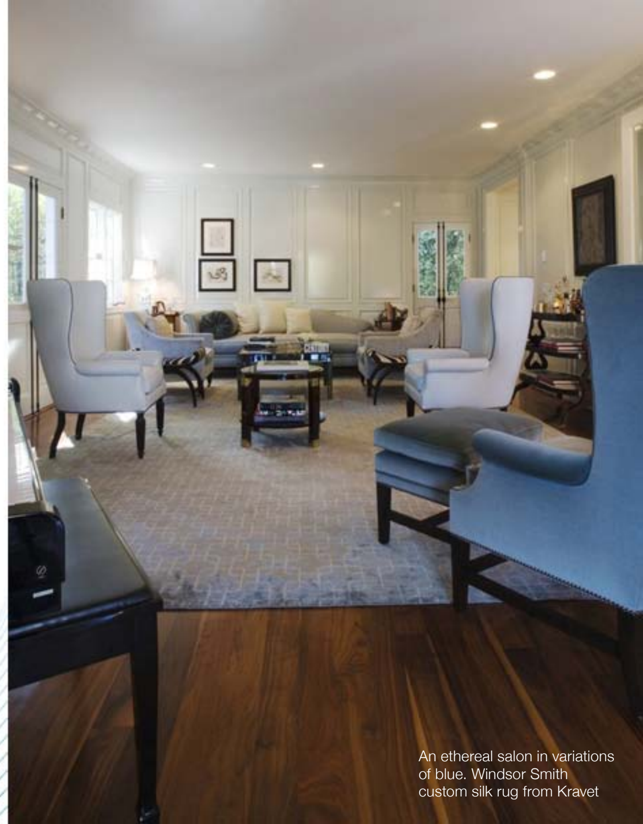
An ethereal salon in variations of blue. Windsor Smith custom silk rug from Kravet

things that are classic and familiar, but we don't want to be left behind on the 'new.' I love the European sensibility where a new generation moves into their ancestral home and injects into it their modern way of life. Timeless design in everyday living – that's the feeling I'm out to capture."