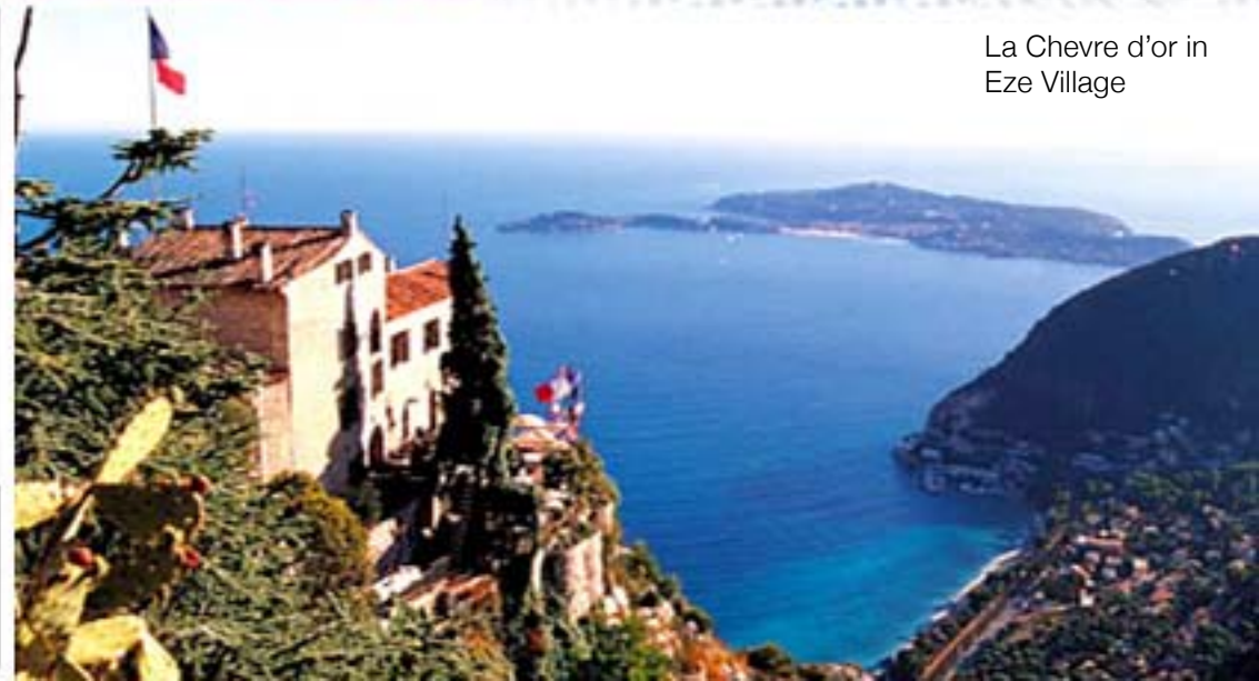
La Chevre d'or in Eze Village