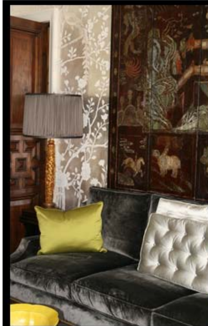
Windsor Smith fabrics in nuances of hard to define colors. Subtlety in colors and textures are key approaches in her textiles

GARDENING or FLORAL: Tomato vines spiraling around cones made of twigs, exterior gardens that creep indoors, trelliage and chateau boxes in morning rooms and along garden walls, large bunches of garden roses and viburnum in porcelain buckets.